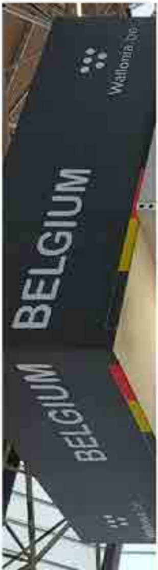
NON FOOD SECTOR : HALL 10 stand 10.D28