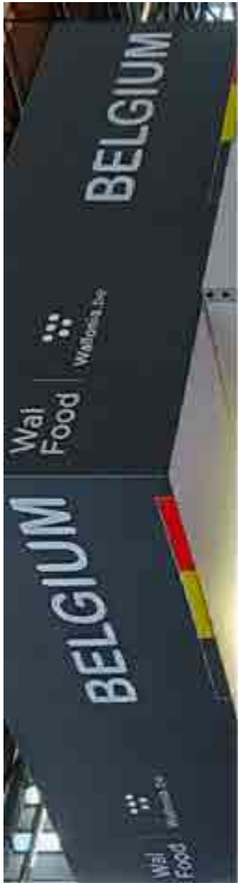
FOOD SECTOR : HALL 5 stand 5.B89