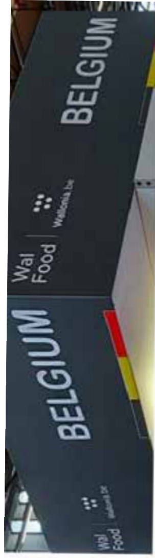
FOOD SECTOR : HALL 5 stand 5.B89