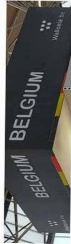
NON FOOD SECTOR : HALL 10 stand 10.D28